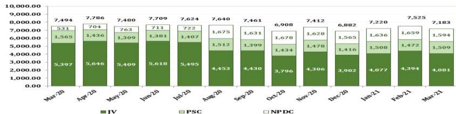
Average Daily National Gas Production (mmscfd)